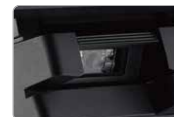
2D Barcode Scanner

Dressed from head to toe in timeless black or white color, the only trend that never goes out of style, and with stylish touches added throughout, HS-3500 Series is not just a piece of machinery, it is an elegantly crafted piece of art that looks right at home in any store decoration.