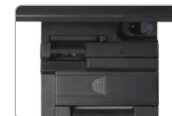
Optional Built-in MSR Fingerprint Sensor and RFID Reader